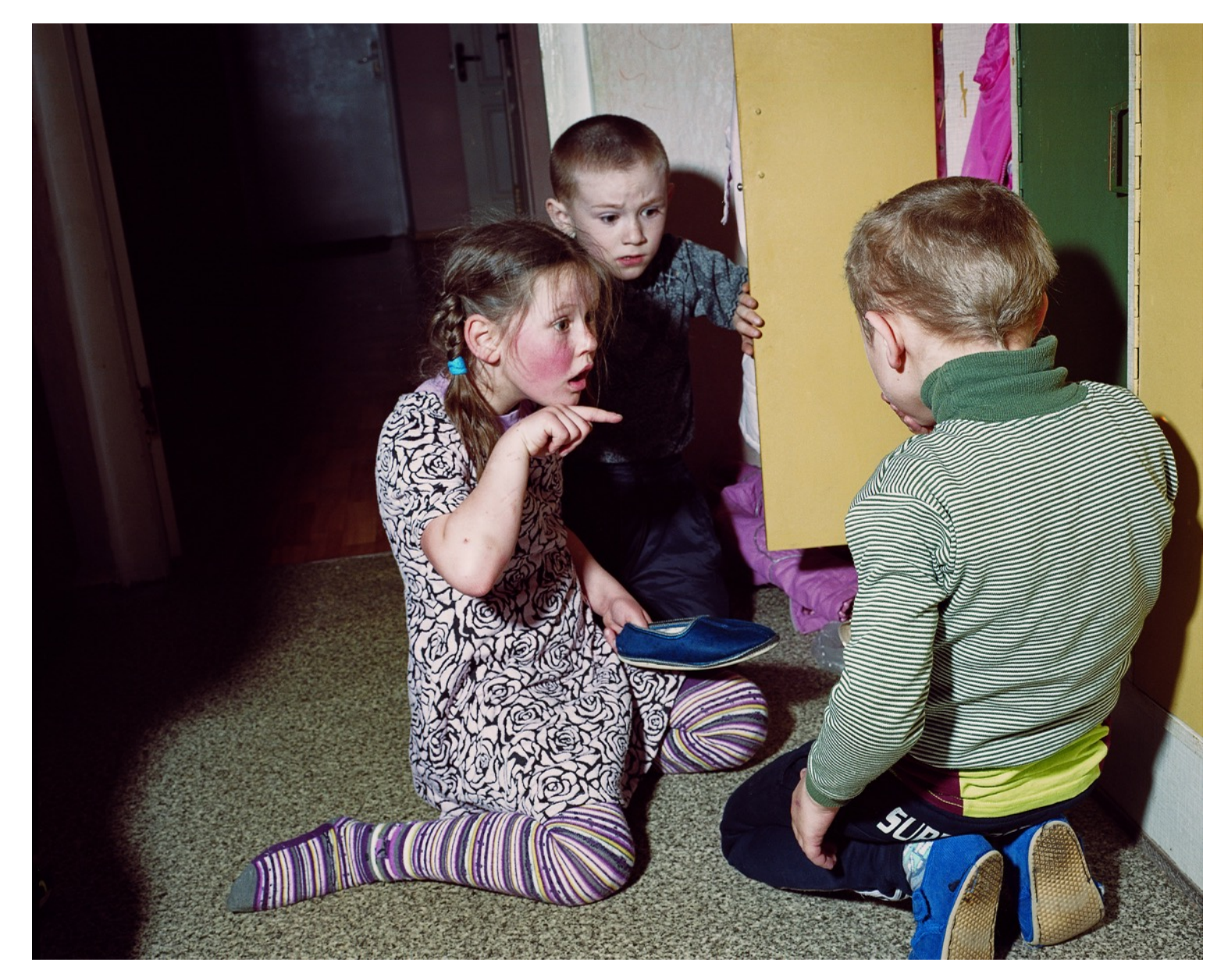
Zhytomyr Special Boarding School for Deaf Children, Ukraine, 2, 2016.