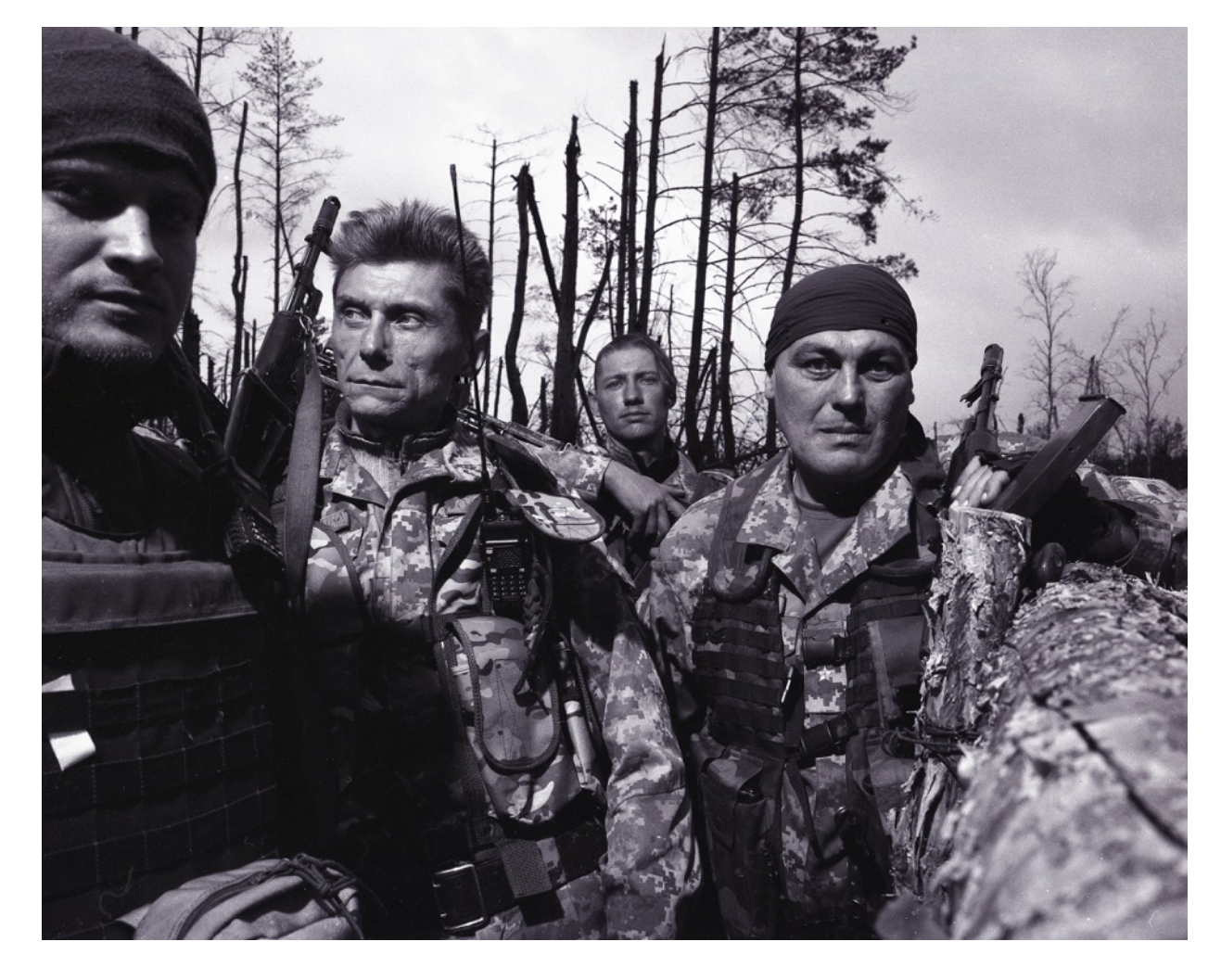
'Stalingrad' checkpoint, East Ukraine, 2, 2016, Mark Neville

When I visited 'Stalingrad' in September 2016 the forest surrounding the checkpoint was black, the pine trees broken in half and charred by the explosions.