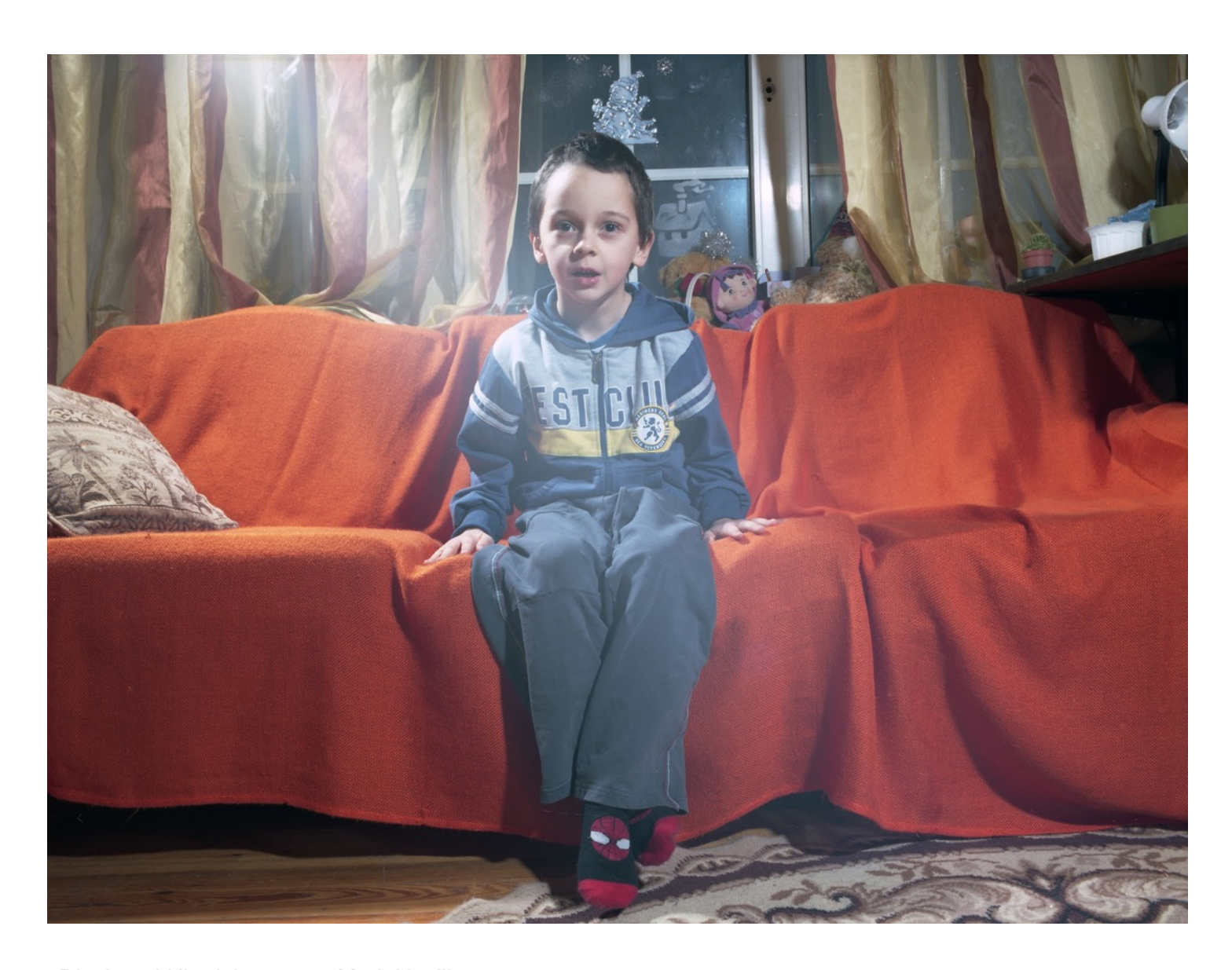
Displaced Ukrainian, 2016