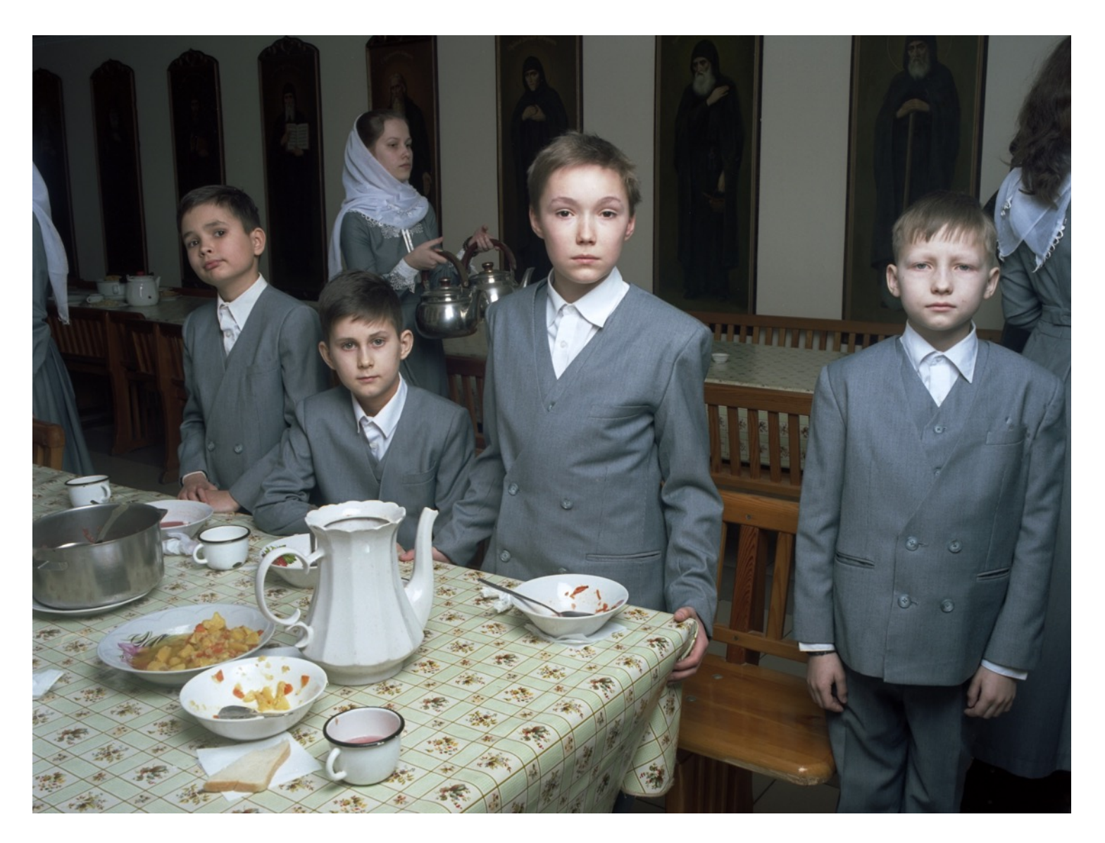
Lavra Christian Orthodox Church Kyiv, 2017