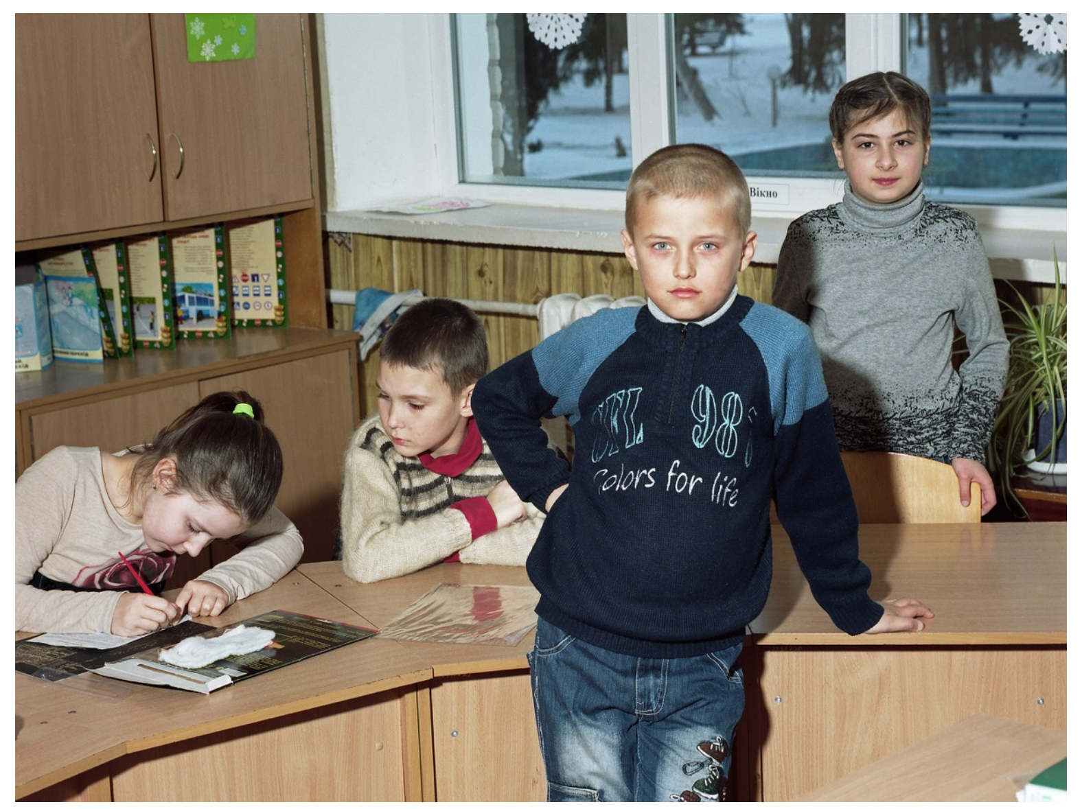
Zhytomyr Special Boarding School for Deaf Children,2'