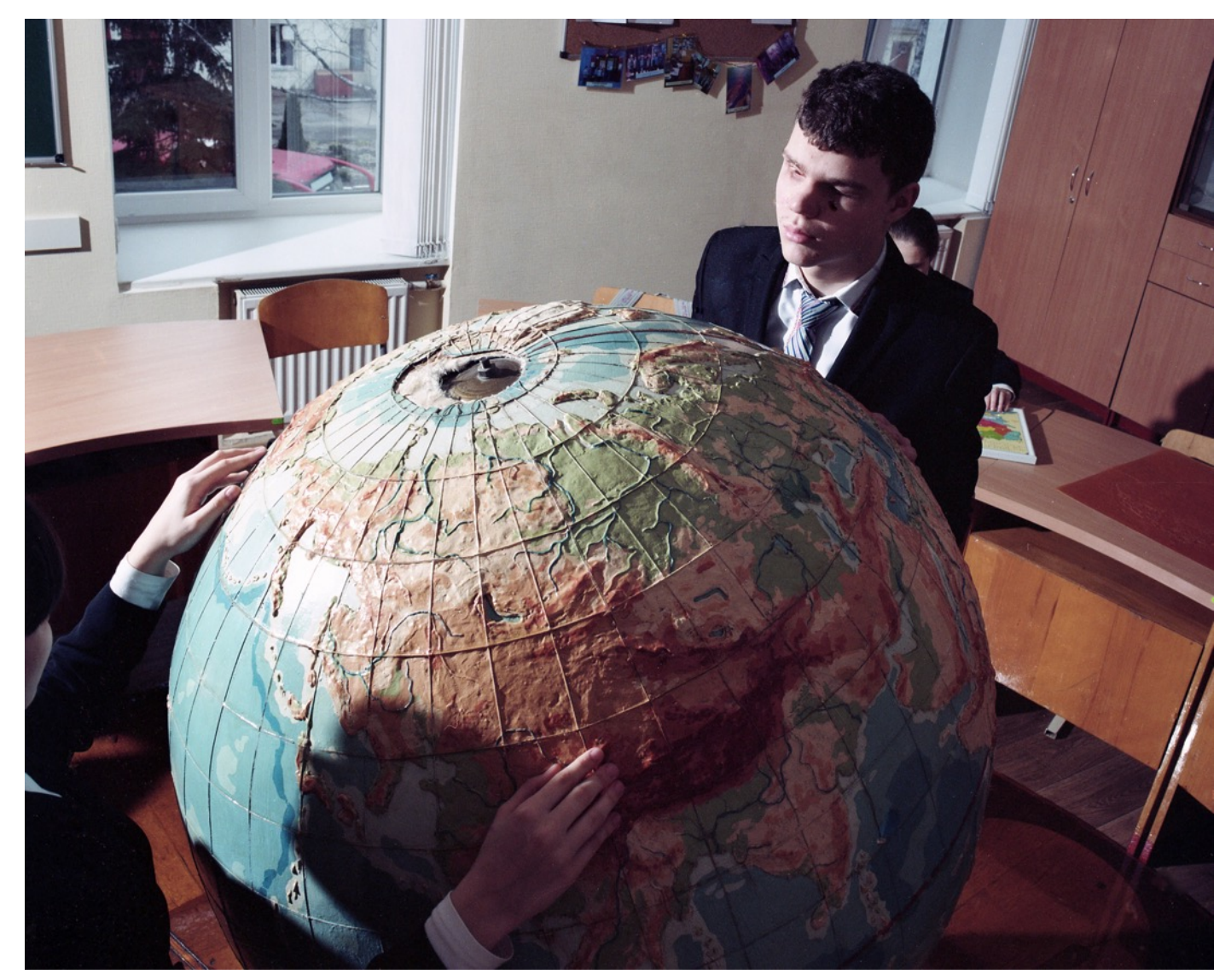
Kharkiv Regional Special school for Blind Children, 2016, Mark Neville

All schools in Ukraine are now expected to accept IDPs. More and more boarding schools which were originally established to exclusively serve the deaf or the blind, are now taking in the displaced or orphans. Some schools in Eastern Ukraine still adhere to a Soviet-style "exclusive" system, such as the Kharkiv Regional Special school for Blind Children.