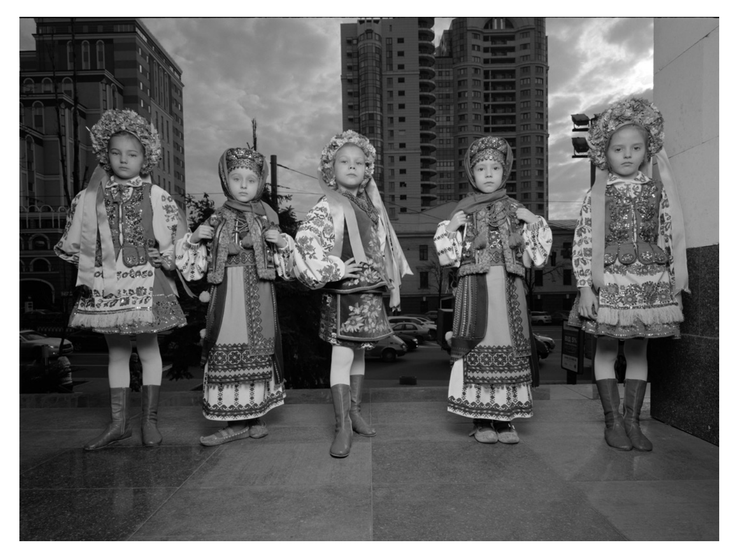
Children who attend the Virskiy Choreography School in Kyiv, wearing national dress, 2017

Virskyi School of Choreography invites young people who were studying folk dances in their native towns (before being displaced to Kyiv) to attend classes and concerts for free. The re-enforcement of Ukrainian cultural identity through symbols such as national dress, dances, songs and the use of the Ukrainian language seemed to promote a feeling of security among many of the displaced people we interviewed in Ukraine.