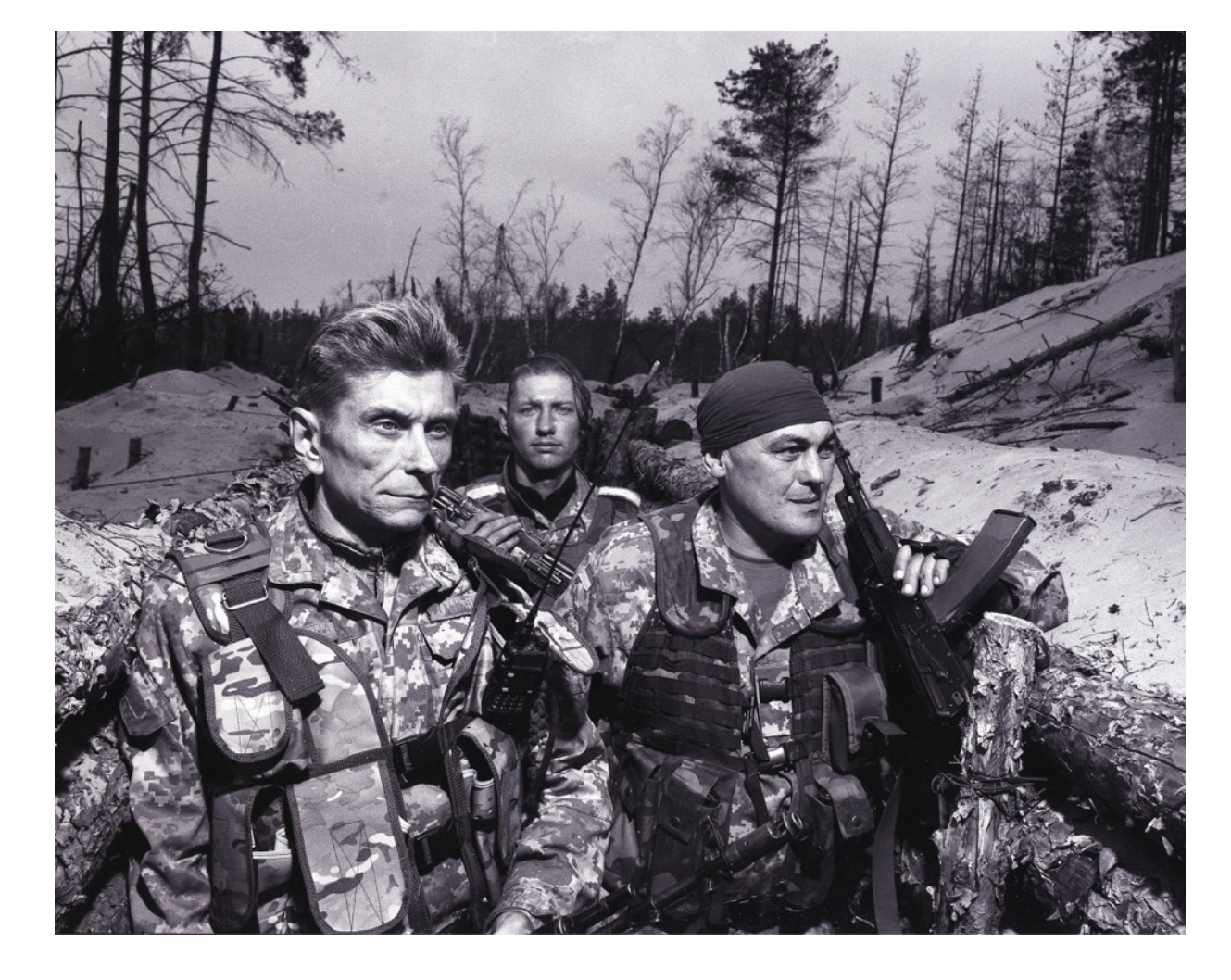
'Stalingrad' checkpoint, Donbas, 1, 2016, Mark Neville

We would have to navigate a series of military checkpoints, which became increasingly frequent the closer to the frontline we got. The most easterly checkpoint in Donbas is referred to by the nickname "Stalingrad" to reflect the frequent shelling.