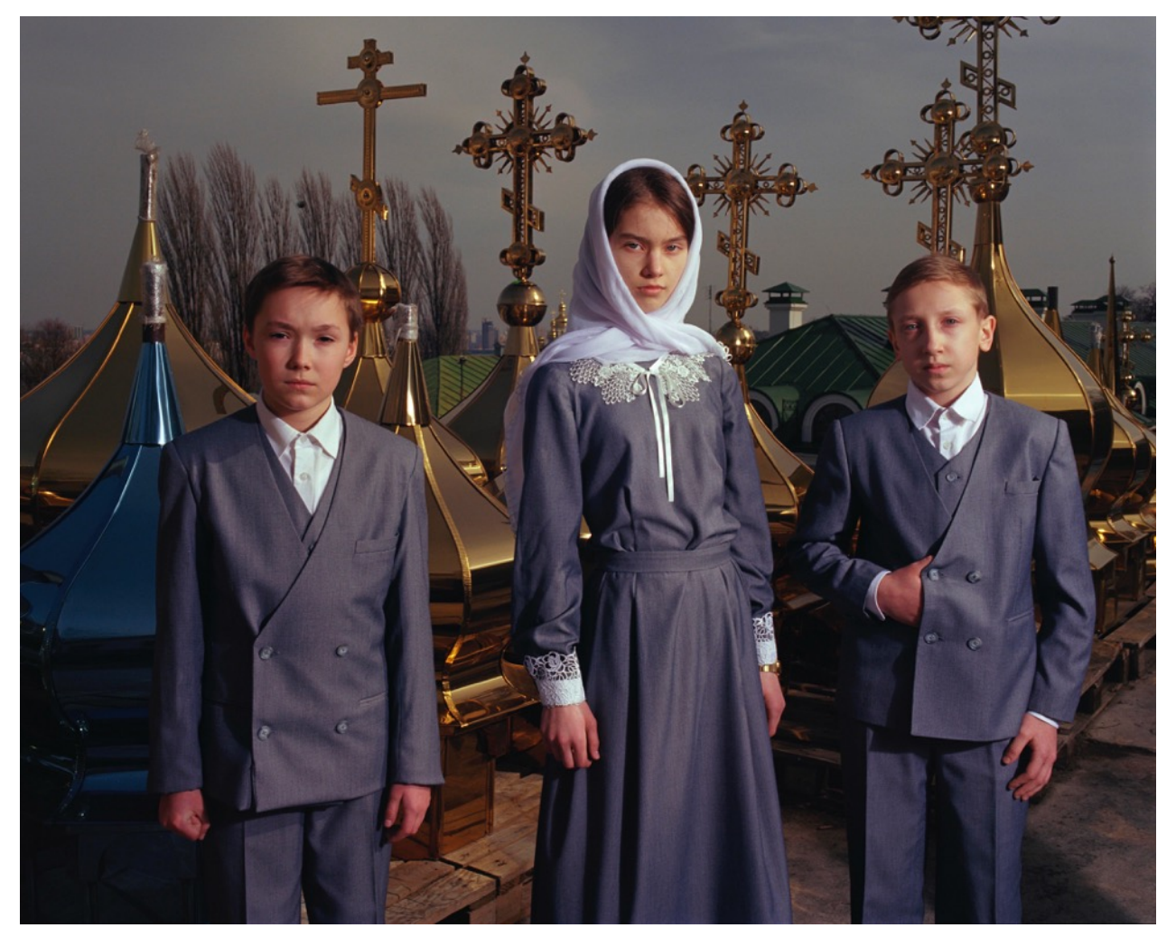
The Choir at Kiev Pechersk Lavra Orthodox Church (Moscow Patriarchate), 2017

of Ukrainian society, and the churches play a role with regard to the displaced. Since Ukraine gained independence in 1991, the Ukrainian Orthodox Churches of the Kiev and the Moscow Patriarchates have been the country's largest confessions.