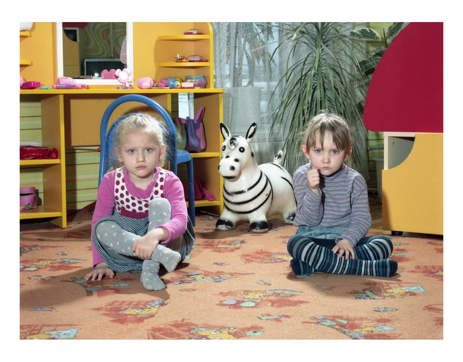
'Father's House' Rehabilitation Centre for Women and Children in Sviatopetrivske, 2016