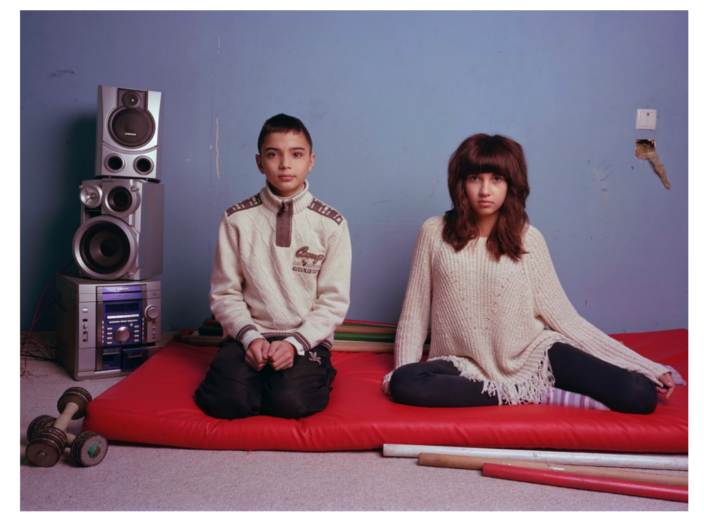
Psychological rehabilitation camp 'Lisova Zastava', Dymer Village, 1, 2016

A group of one hundred children arrive, only to leave and be replaced by the next group two weeks later. I was present as one such group of children arrived and the distress was palpable.