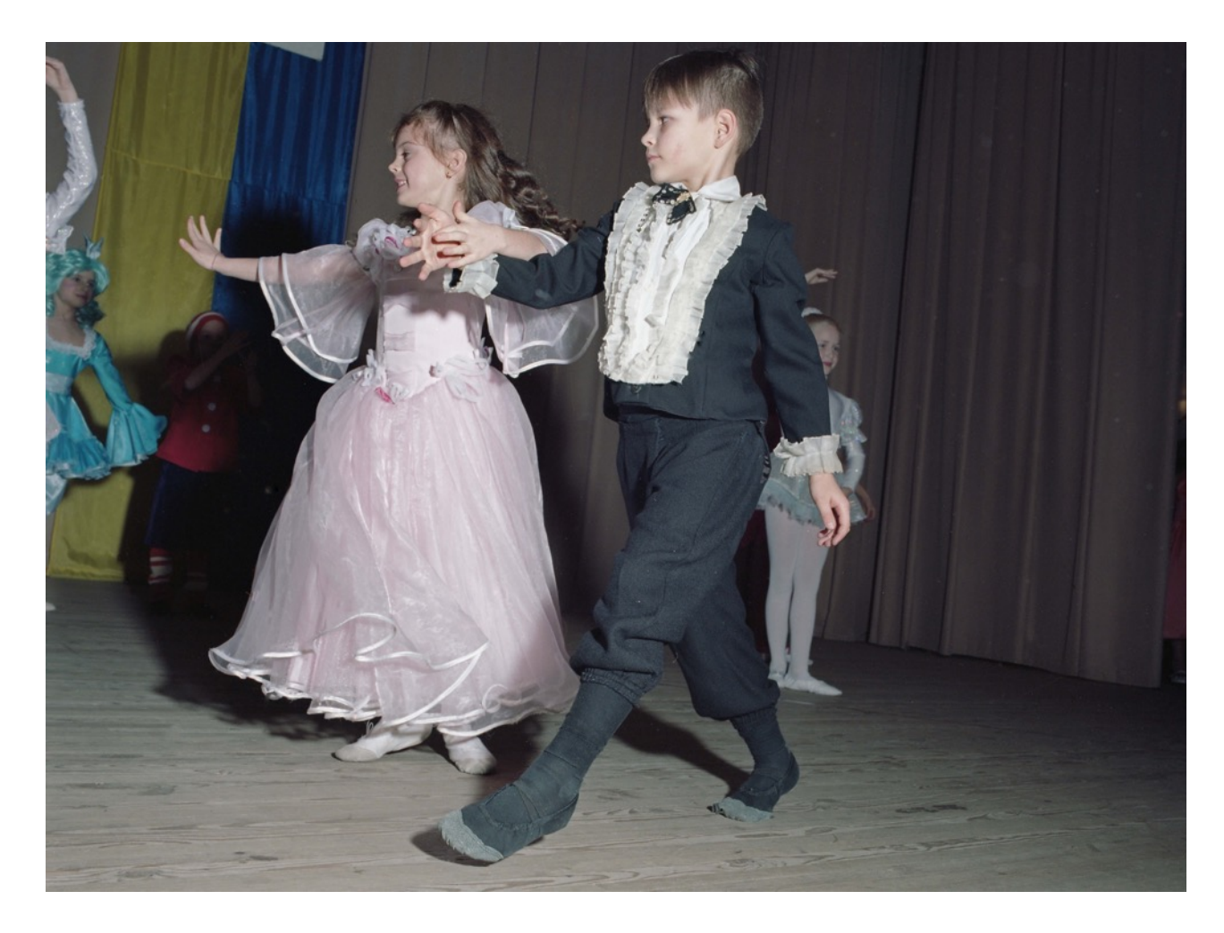
Performance at Kyiv Military Hospital, 1, Mark Neville, 2016.

On the second day of my stay there a touring troupe of child performers visited the hospital. Some of the children sang or played instruments, some were acrobats, but almost all wore traditional Ukrainian national dress. It was immediately clear that the preservation of traditional Ukrainian culture seemed to played a significant role in the conflict.