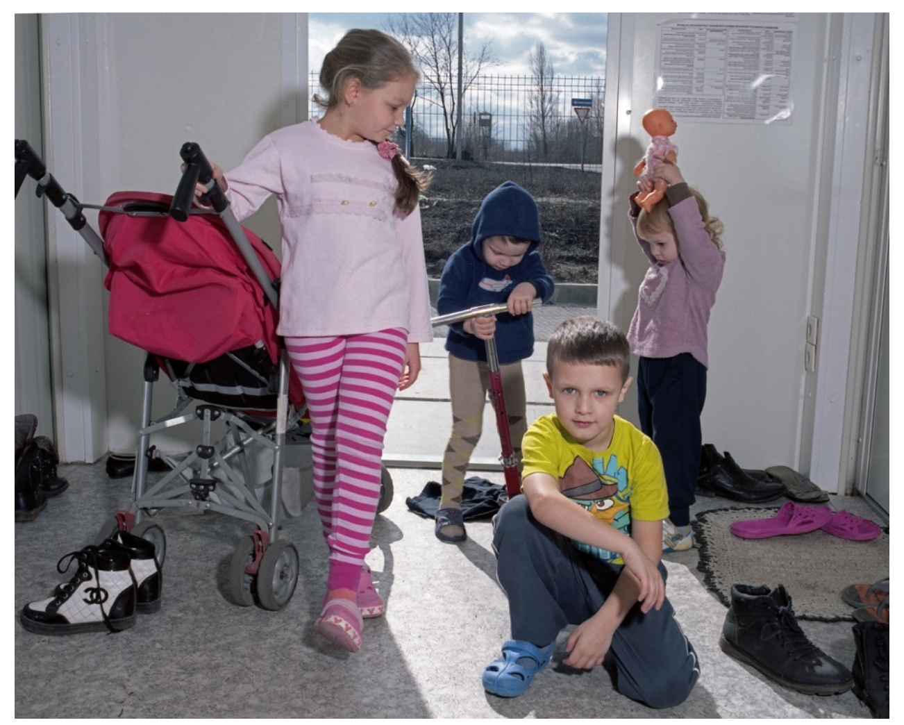
IDP modular camp outside Kharkiv, 2016

On the outskirts of Kharkiv a modular camp has been funded and installed by the German Foreign Office in order to support IDPs in Ukraine. Housing about 400 people, it has successfully provided at least a temporary place of residence. The longer term goal was that these IDP's would ultimately be able to build a new life in Kharkiv, but sadly most have been unable to find financial means to leave the shelter.