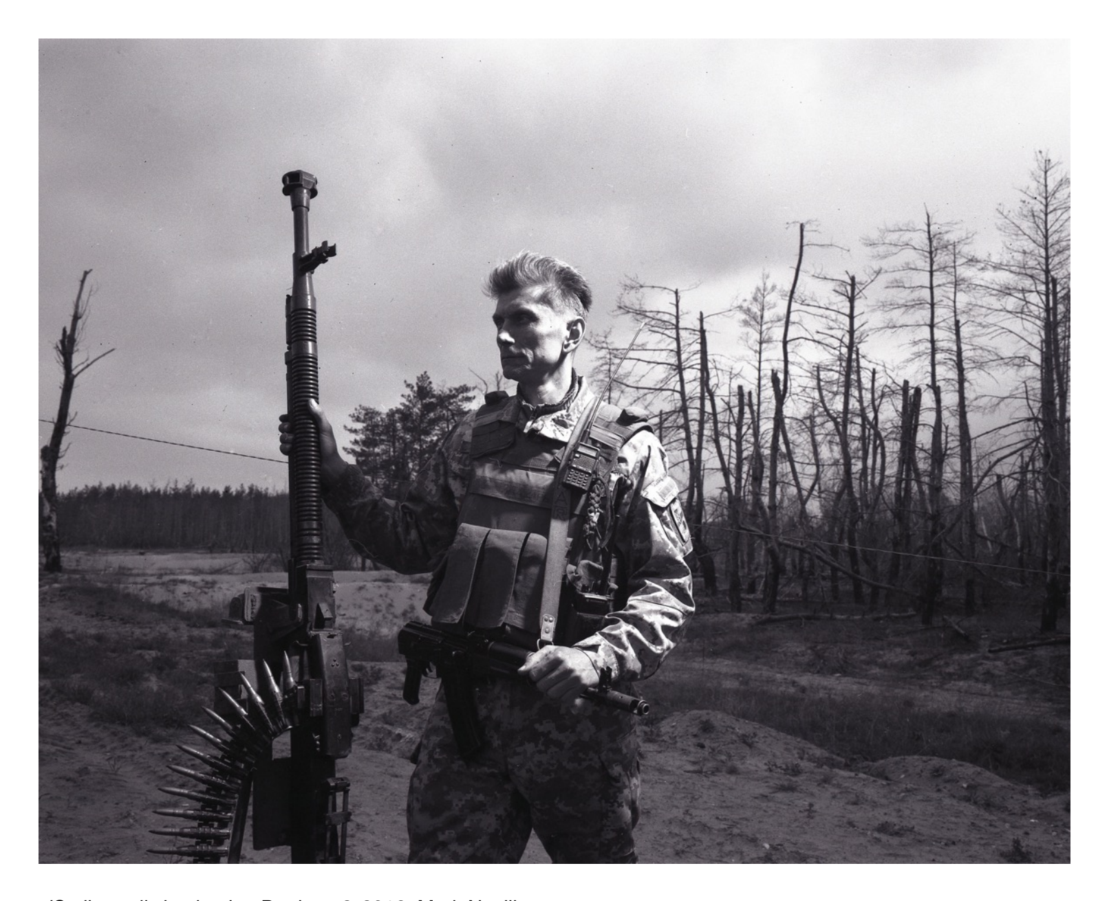
'Stalingrad' checkpoint, Donbas, 3, 2016