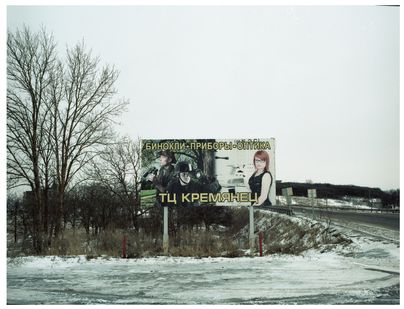
Billboard outside Kharkiv, 2016, Mark Neville

Long stretches of very poor road linking Central and Eastern Ukraine were interspersed by billboards, motorway cafes, stray dogs, and occasionally abandoned tanks.