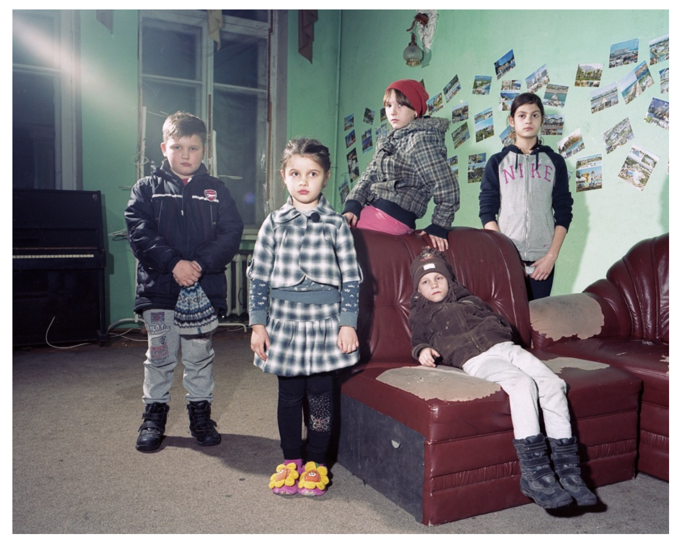
Displaced children at an IDP shelter in Korosteshiv region, 2016, Mark Neville

IDP shelters in Ukraine, which are depressingly similar in almost every regard, are frequently located in previously abandoned buildings, be they churches, sanatoria, hospitals, barracks, or schools, and it is the displaced themselves who find ways to make them habitable, as they struggle with extremely poor sanitation, lighting, and heating.