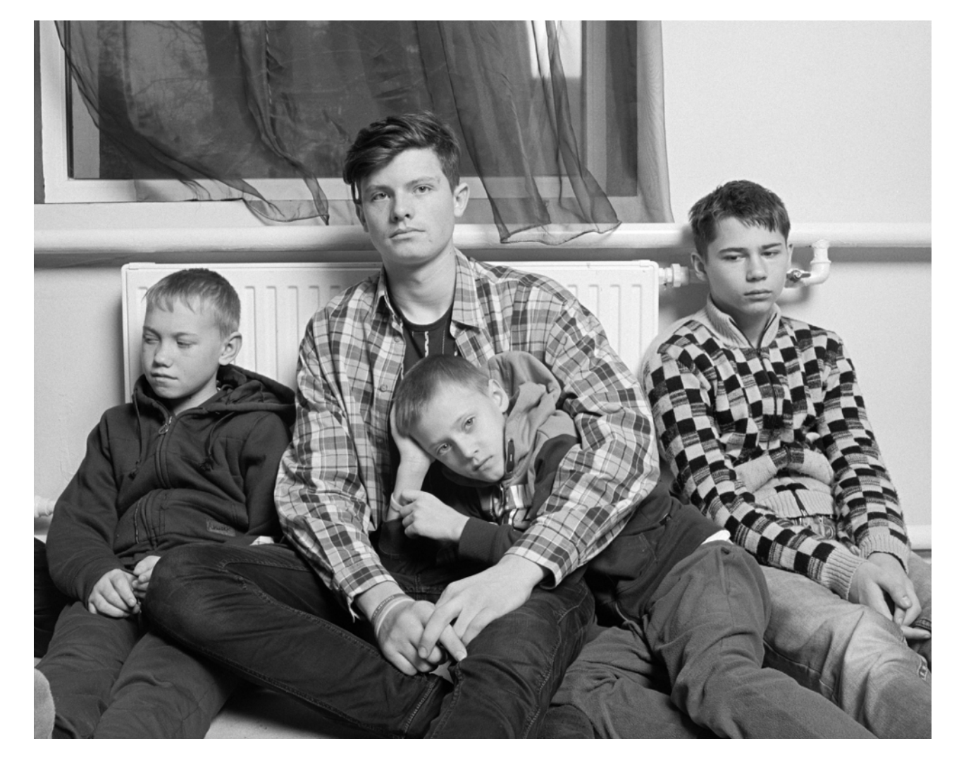
Psychological rehabilitation camp 'Lisova Zastava', Dymer Village, 2, 2016, Mark Neville

One of the very few psychological rehabilitation camps available to displaced children, Lisova Zastava , is located in a forest close to Dymer Village in Kyiv region. It provides support and treatment, including a schedule of art therapy classes and horse riding for a limited two week period only, to children who normally live on the frontline, or who have been displaced or orphaned due to the conflict.