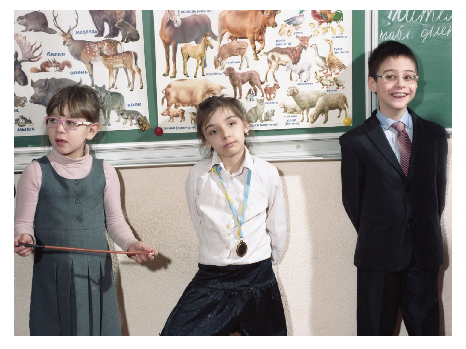
Kharkiv Regional Special school for Blind Children, 2, 2016, Mark Neville

Fully inclusive schools, which are rare, do not separate "general education" and "special education" programmes; instead, all students learn together. Recently, the Ministry of Education has prepared a general recommendation for the inclusive education of disabled children, but the topic is still controversial.