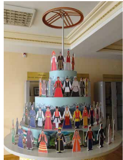
PICTURE 4 Model of the ethnic groups of Kazakhstan in the House of Friendship in Almaty

It remains to be seen whether the forthcoming changes to nationalities policy under Kassym-Zhomart Tokaev will hold the line established by his predecessor and the architect of dual but ambiguous identity. His scope still appears to be limited, for as one of the numerous powers that Nazarbaev secured for himself for his retirement is his role as Chair of the ANK.