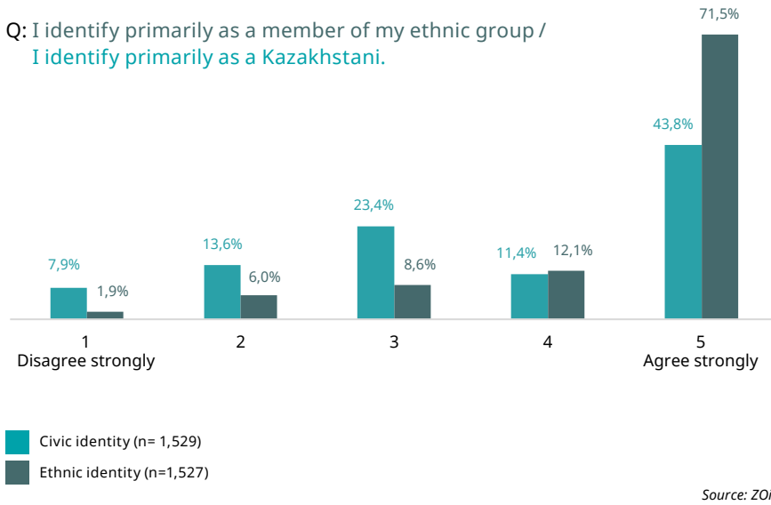
FIGURE 2 Ethnic and civic identity strength by ethnic groups (mean parameters)