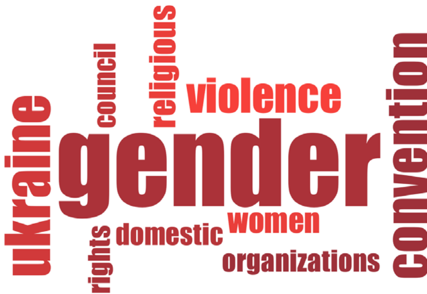
FIGURE 3 Wordcloud based on analysed documents